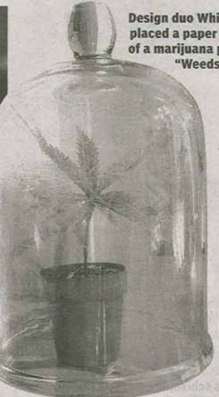
Design duo White Webb placed a paper sculpture of a marijuana plant in the "Weeds" room.